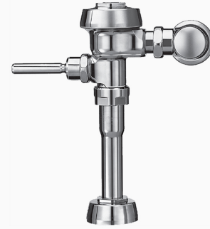
Variation Not Shown: Polished Brass